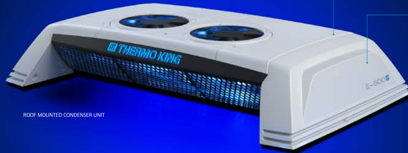
ROOF MOUNTED CONDENSER UNIT

A VERSATILE REFRIGERATION SOLUTION THAT'S THE BEV ANSWER TO INNER-CITY LIMITS.