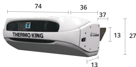
T-890, T-890 MAX, T-1090, T-1090 MAX, T-1090 SPECTRUM